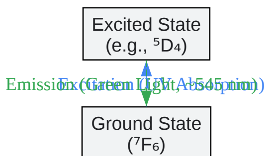
Simplified Tb^{3+} Luminescence

Click to download full resolution via product page