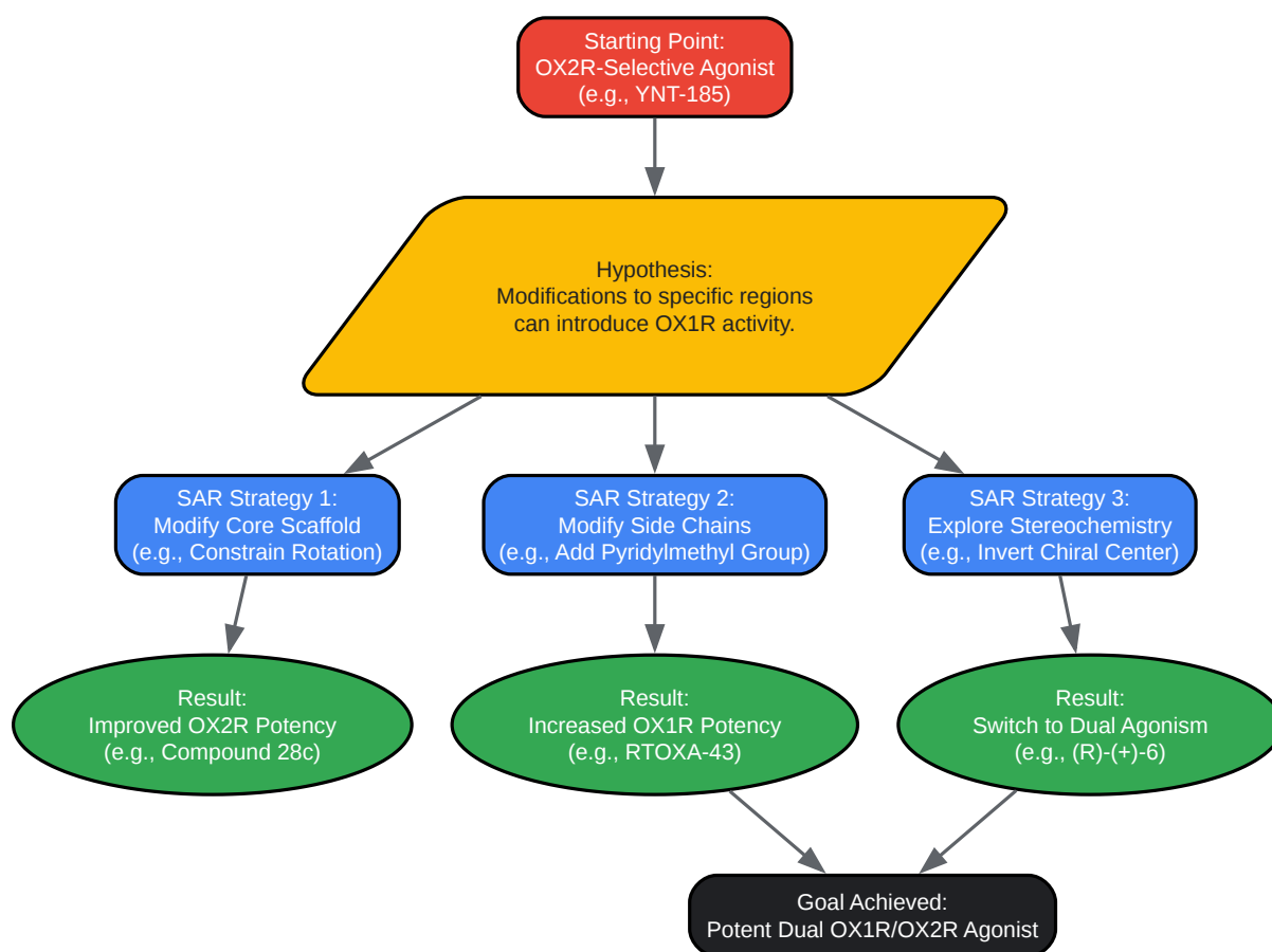
Figure 3: SAR Logic for Developing Dual Agonists

Click to download full resolution via product page