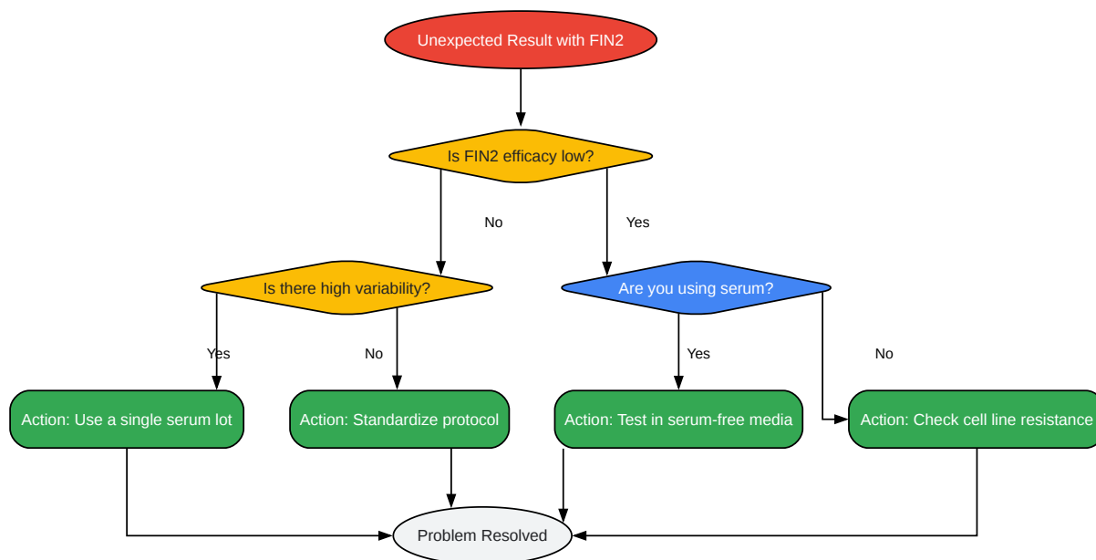
Caption: Experimental Workflow for FIN2.

Click to download full resolution via product page