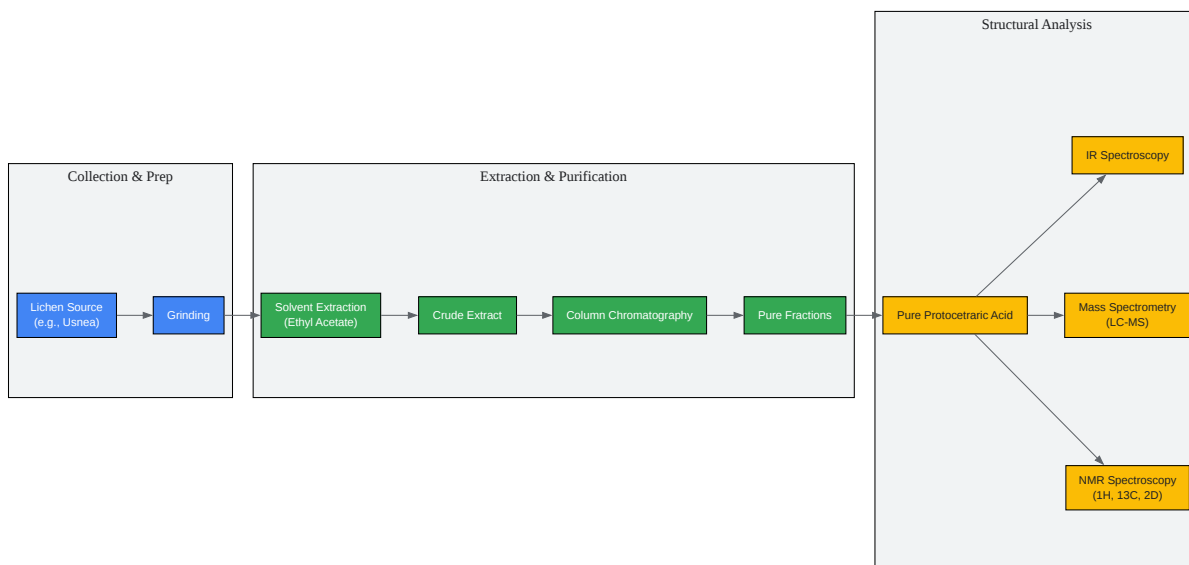
Workflow for Protocetraric Acid Isolation and Characterization

Click to download full resolution via product page