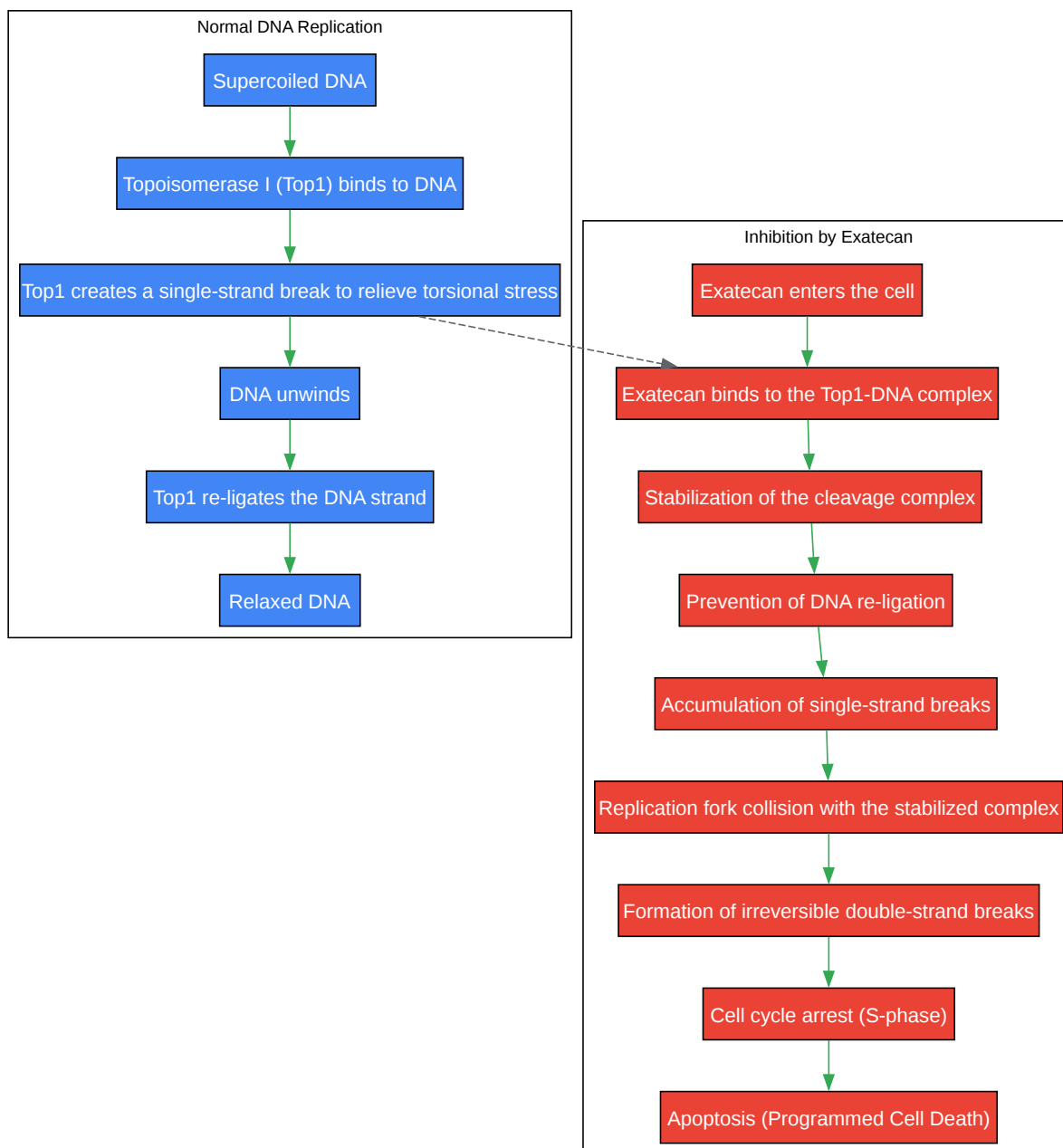
Mechanism of Topoisomerase I Inhibition by Exatecan