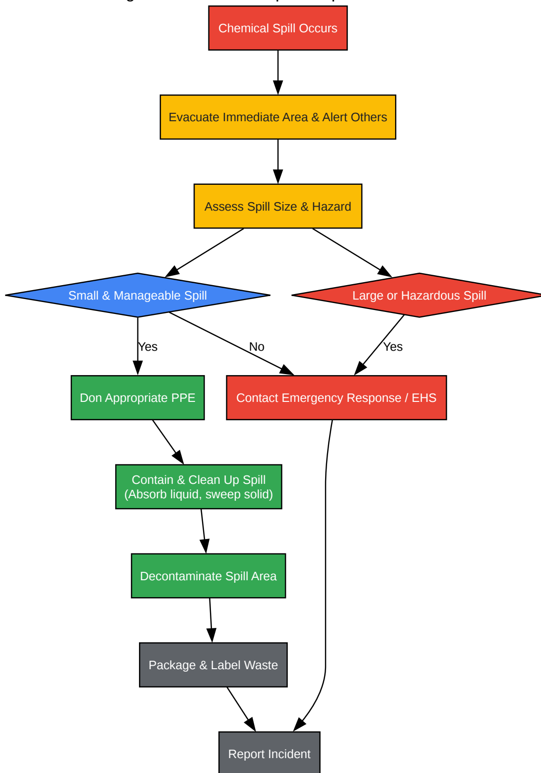
Diagram 1: Chemical Spill Response Workflow

Click to download full resolution via product page