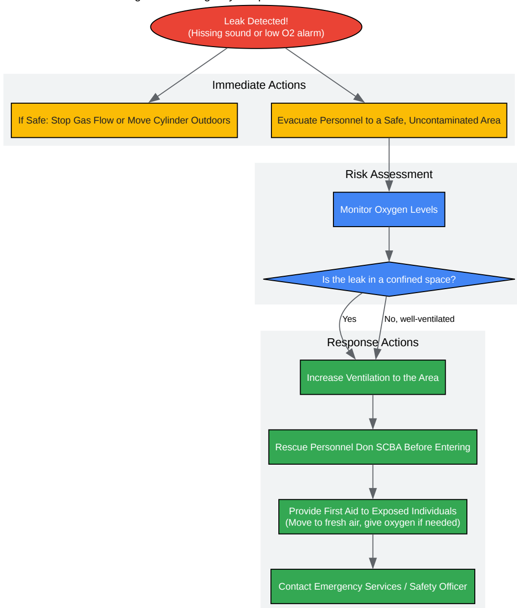
Diagram 2: Emergency Response Plan for Helium-3 Leak

Click to download full resolution via product page