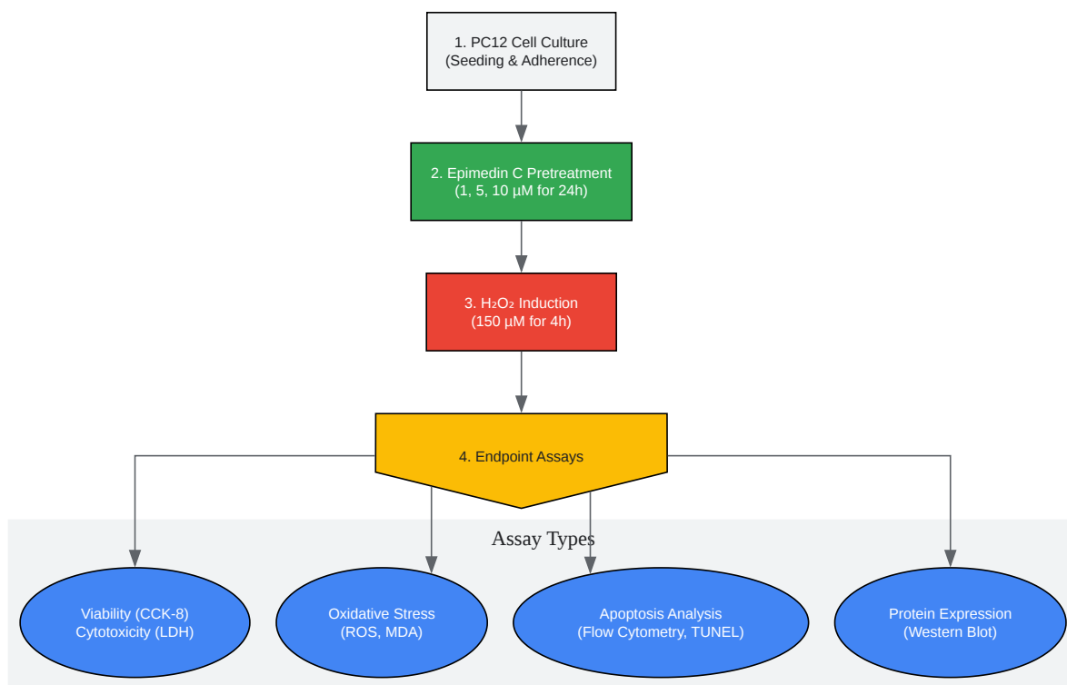
General Experimental Workflow for Epimedin C Studies

Click to download full resolution via product page