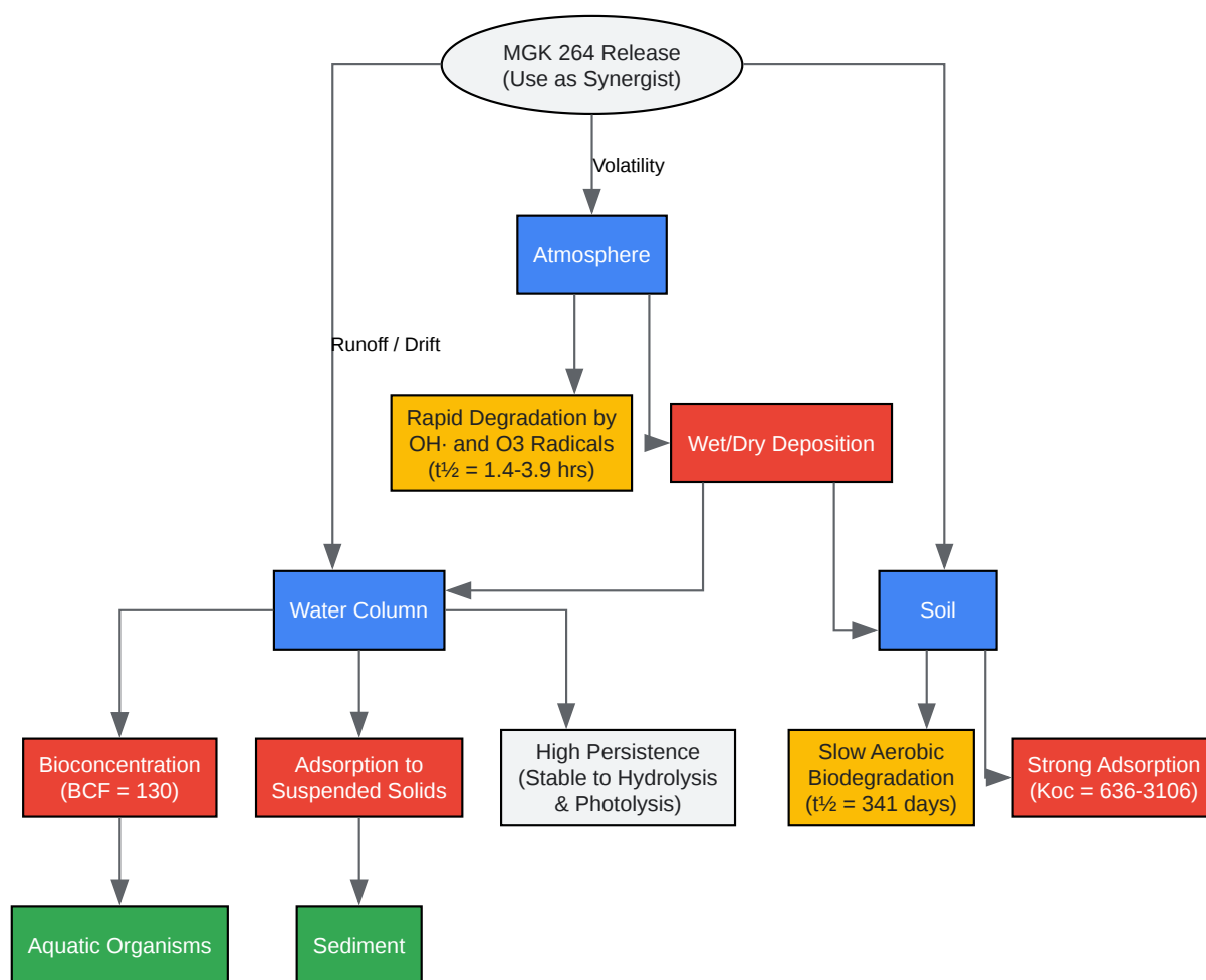
Figure 1. Environmental Fate of MGK 264

Click to download full resolution via product page