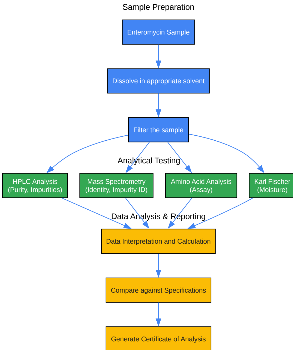
Figure 1: General Experimental Workflow for Enteromycin Quality Control

Click to download full resolution via product page