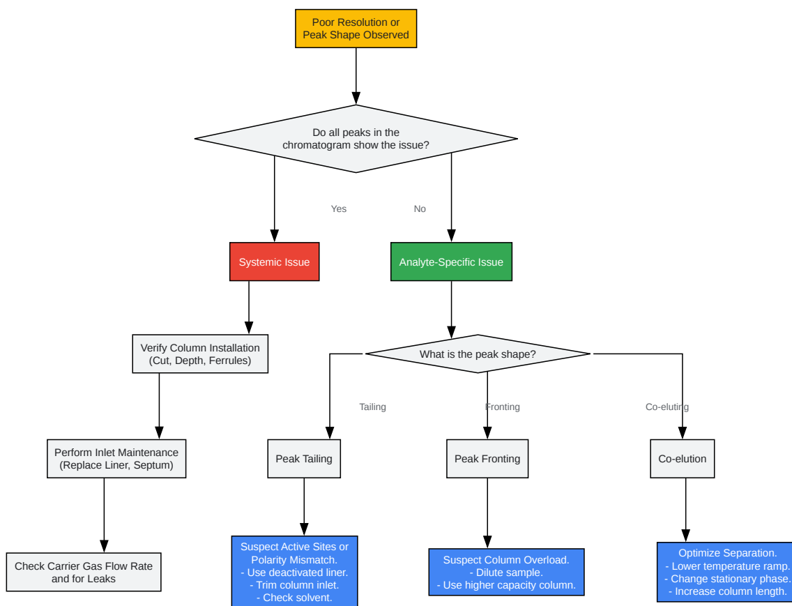
Workflow for Troubleshooting Poor Resolution

Click to download full resolution via product page