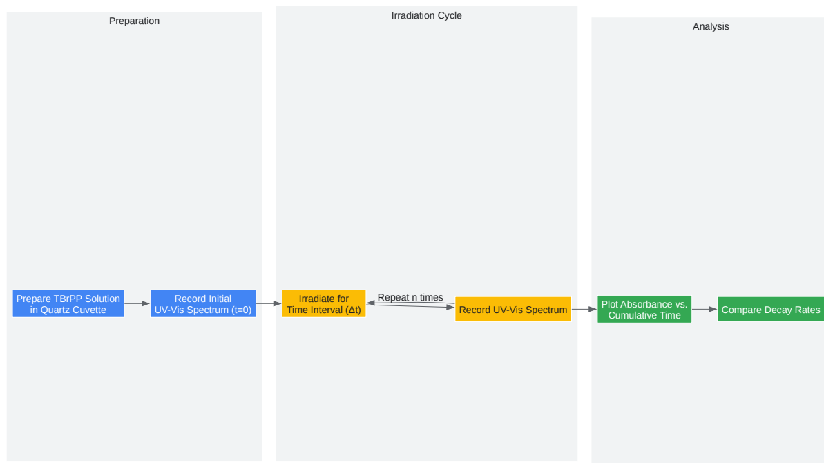
Photostability Assessment Workflow

Click to download full resolution via product page