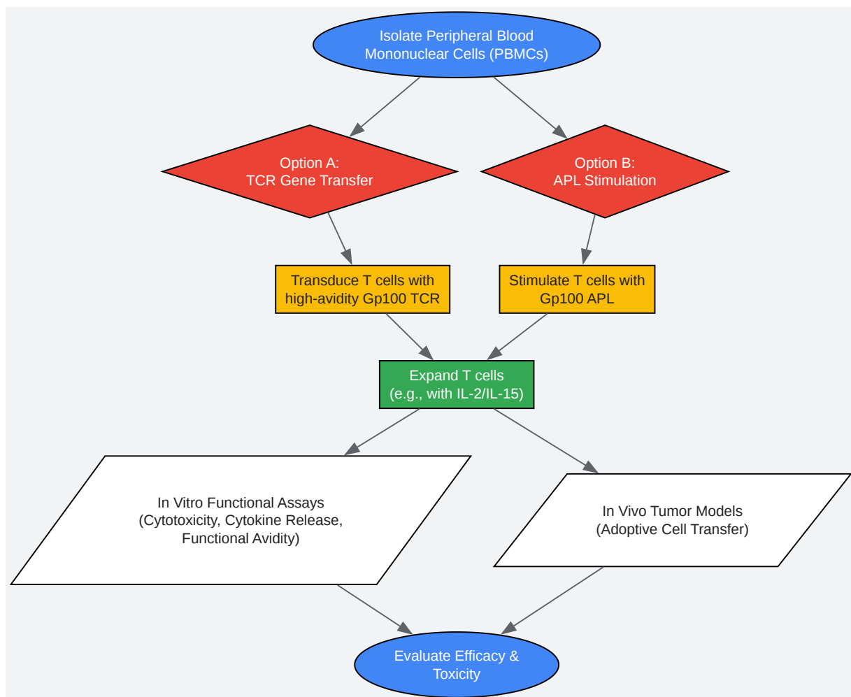
Diagram 2: Experimental Workflow for Enhancing T Cell Avidity

Caption: T cell activation requires TCR recognition of pMHC (Signal 1) and co-stimulation (Signal 2).