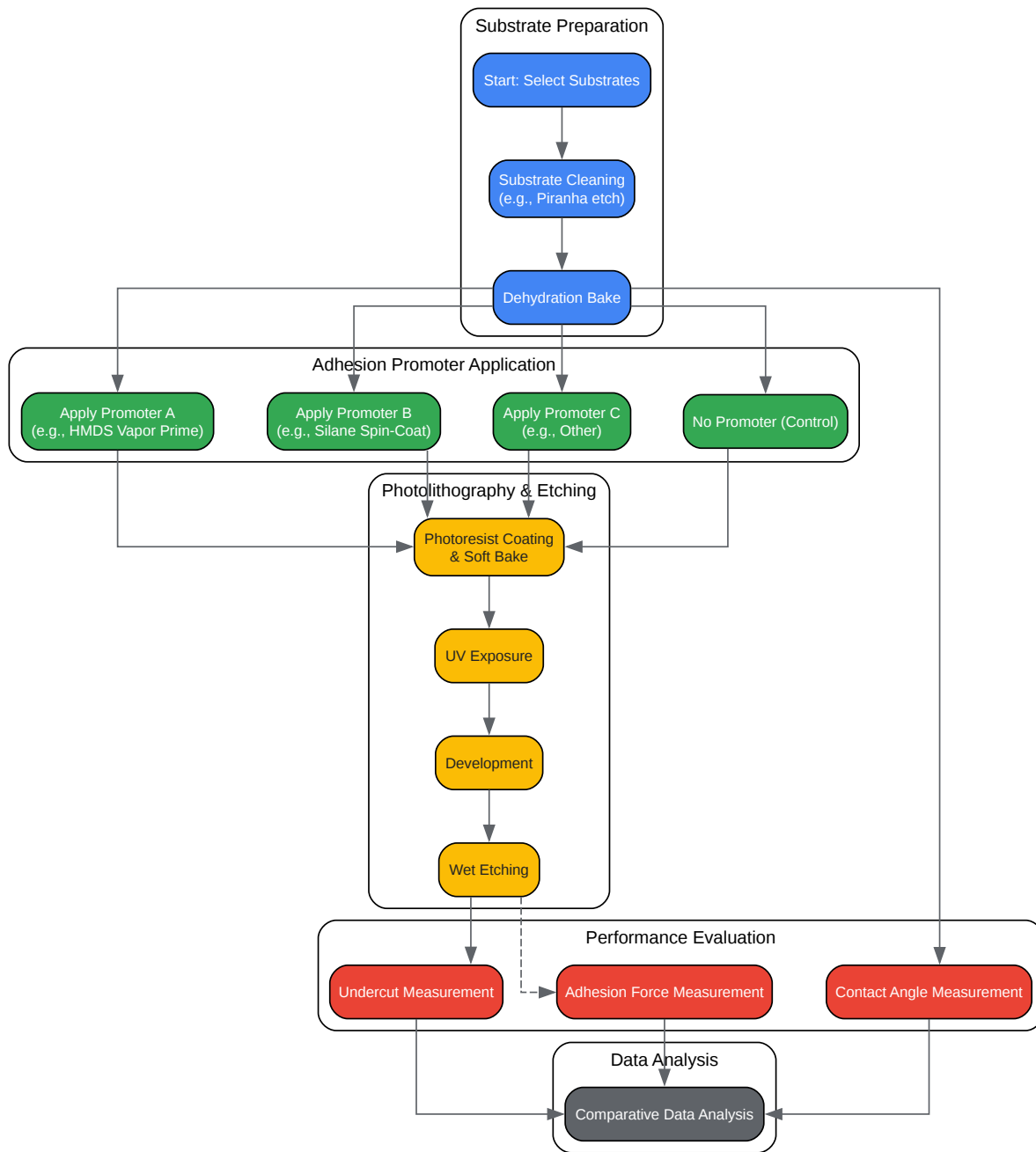
Experimental Workflow for Adhesion Promoter Comparison

Click to download full resolution via product page