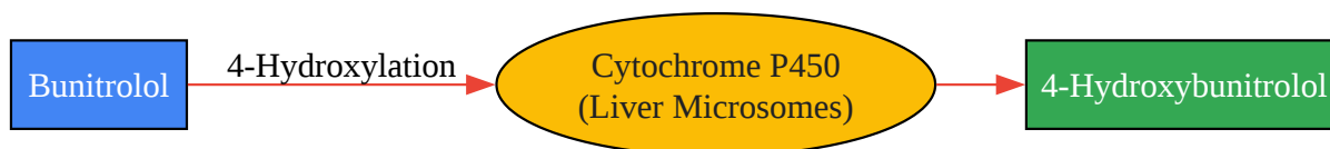
Diagram 2: Bunitrolol Metabolism Pathway

Click to download full resolution via product page