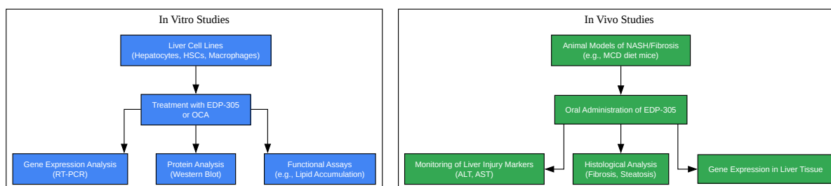
Figure 1: Simplified FXR signaling pathway in hepatocytes upon activation by EDP-305 .

Click to download full resolution via product page