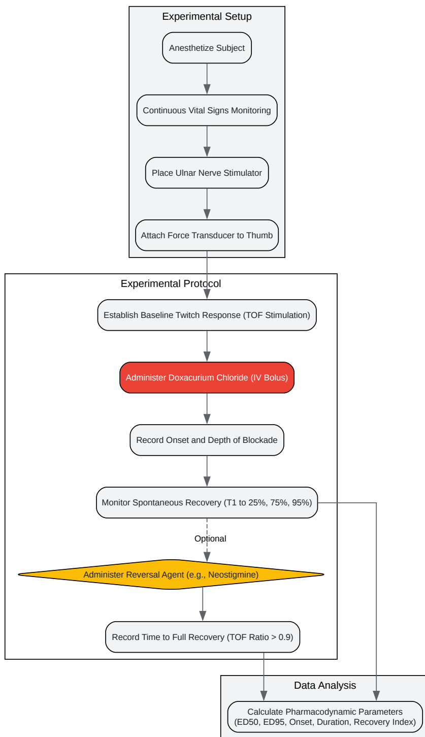
Figure 3: Experimental Workflow for In Vivo Assessment of Neuromuscular Blockade

Click to download full resolution via product page