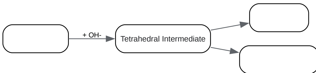
Caption: Proposed acidic degradation pathway of butenylthiourea.

Click to download full resolution via product page