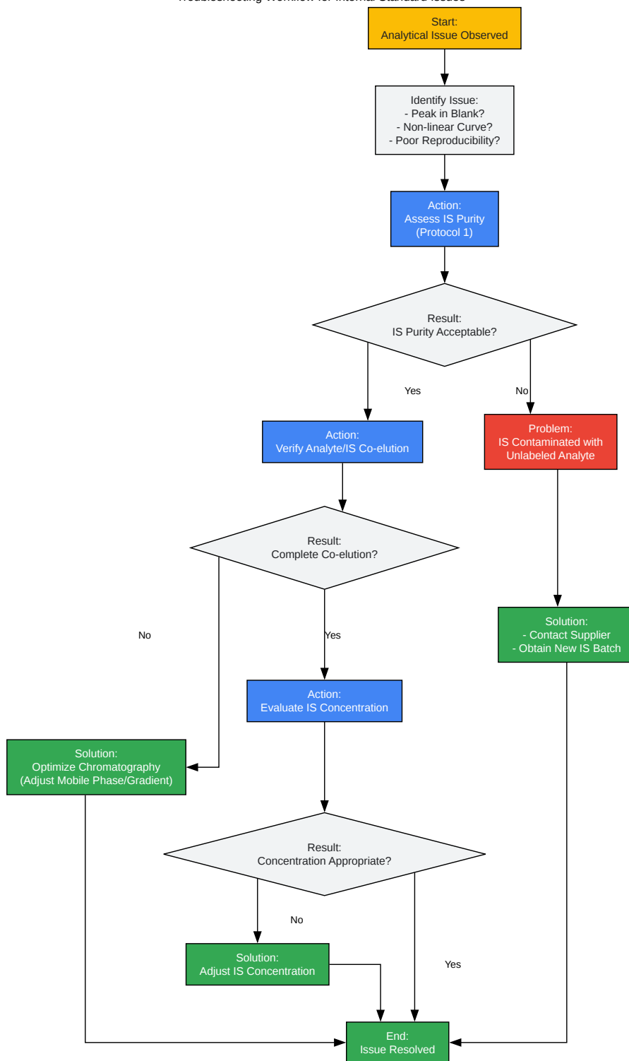
Troubleshooting Workflow for Internal Standard Issues