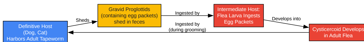
Diagram 3: Dipylidium caninum Life Cycle Highlighting Flea Host

Click to download full resolution via product page