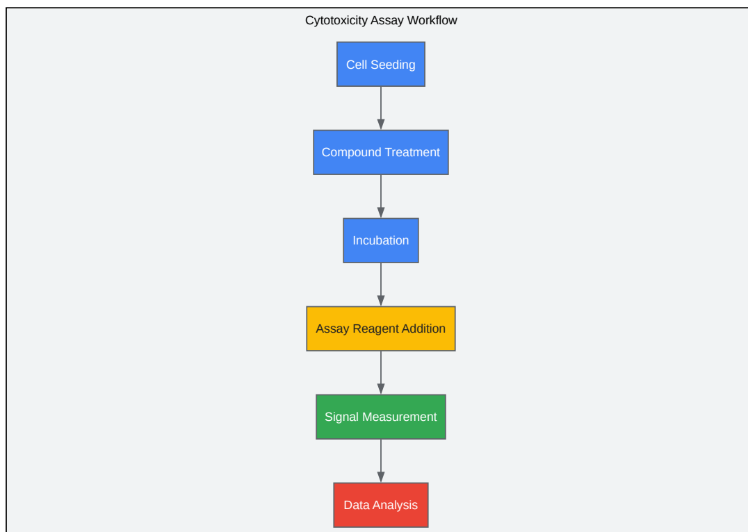
Fig. 1: Proposed cytotoxic mechanism of abietane diterpenes.

Click to download full resolution via product page