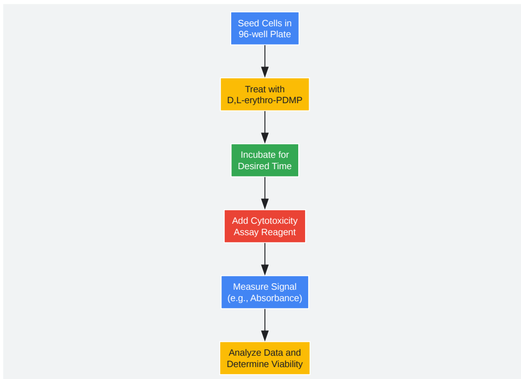
Experimental Workflow for Cytotoxicity Assay

Click to download full resolution via product page