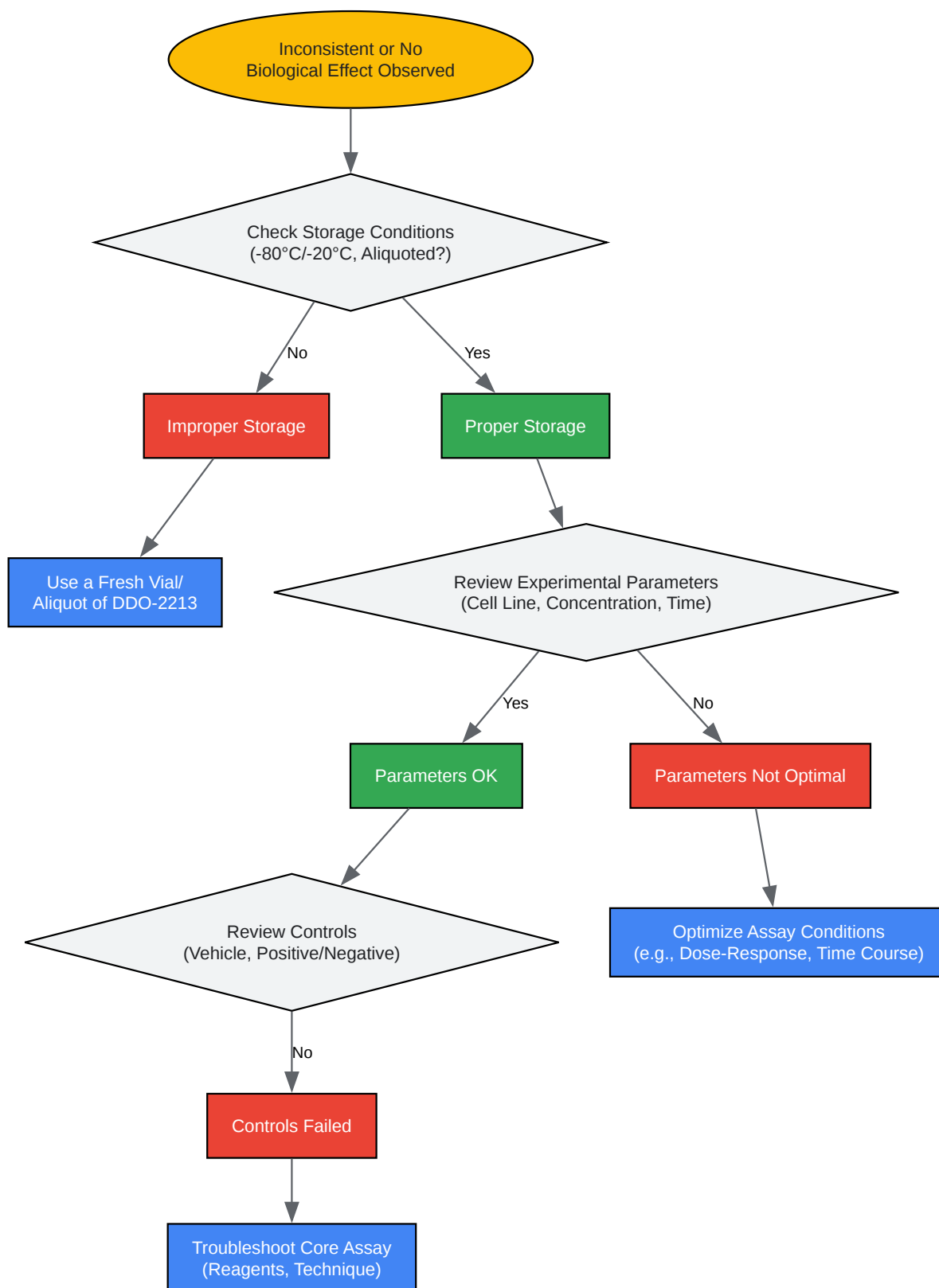
Caption: Experimental Workflow for a Cell-Based Assay with DDO-2213 .

Click to download full resolution via product page