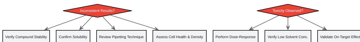
Caption: General experimental workflow for cell-based assays with DCSM06 .

Click to download full resolution via product page