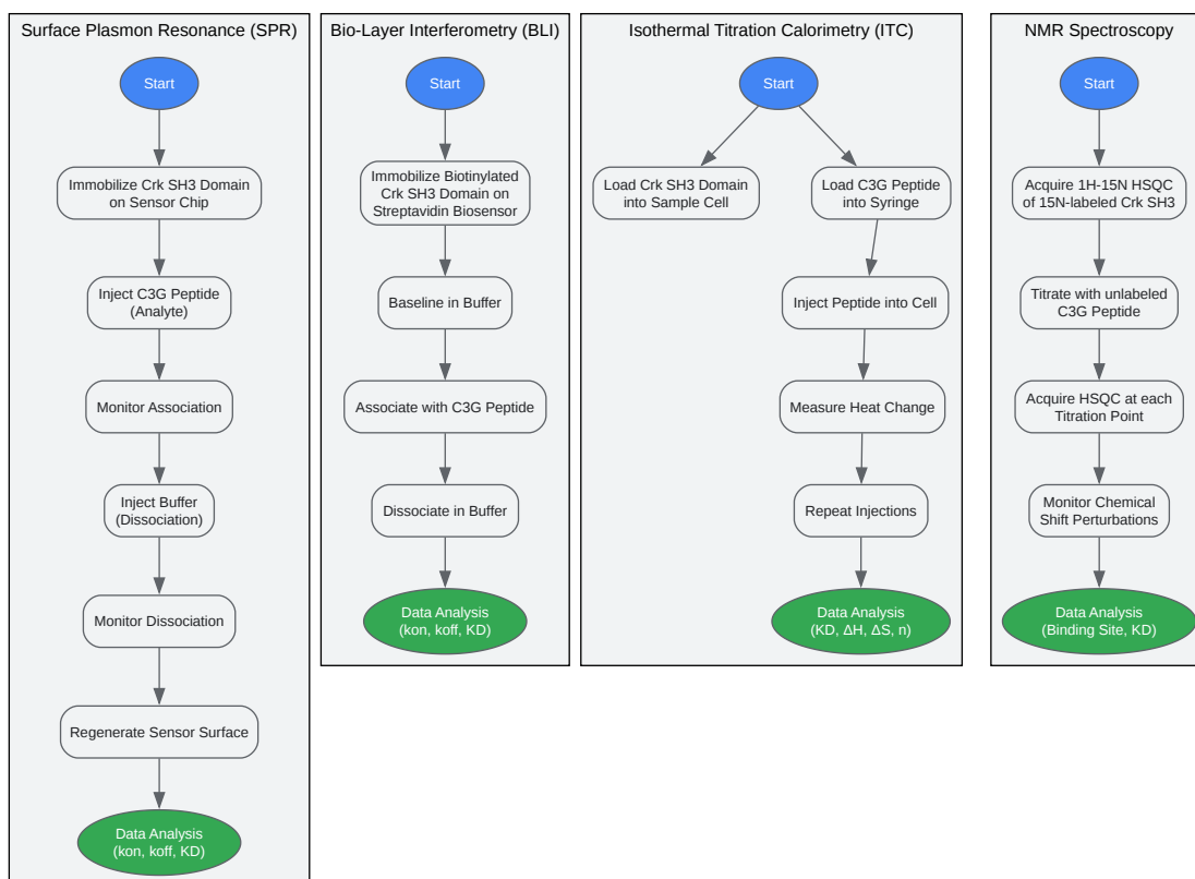
Experimental Workflows for Orthogonal Assays

Click to download full resolution via product page