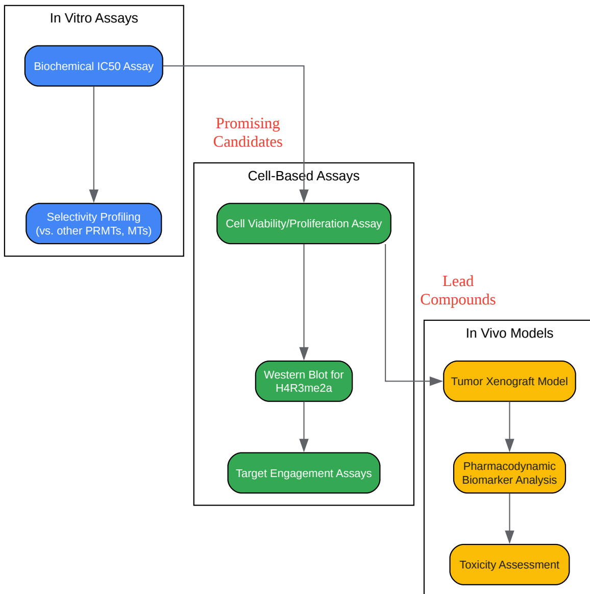
Workflow for PRMT1 Inhibitor Evaluation

Click to download full resolution via product page