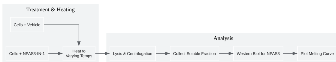
Diagram of the CETSA Workflow

Click to download full resolution via product page