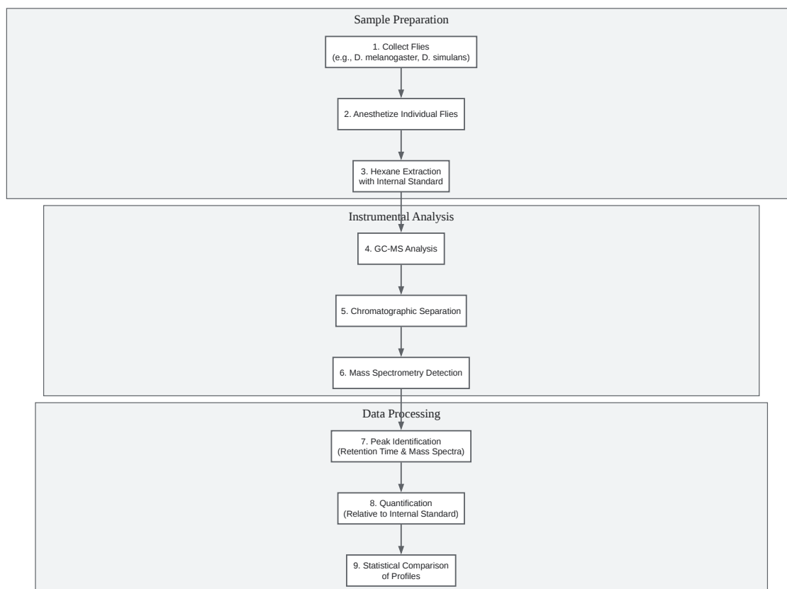
Experimental Workflow for Comparative CHC Profiling

Click to download full resolution via product page