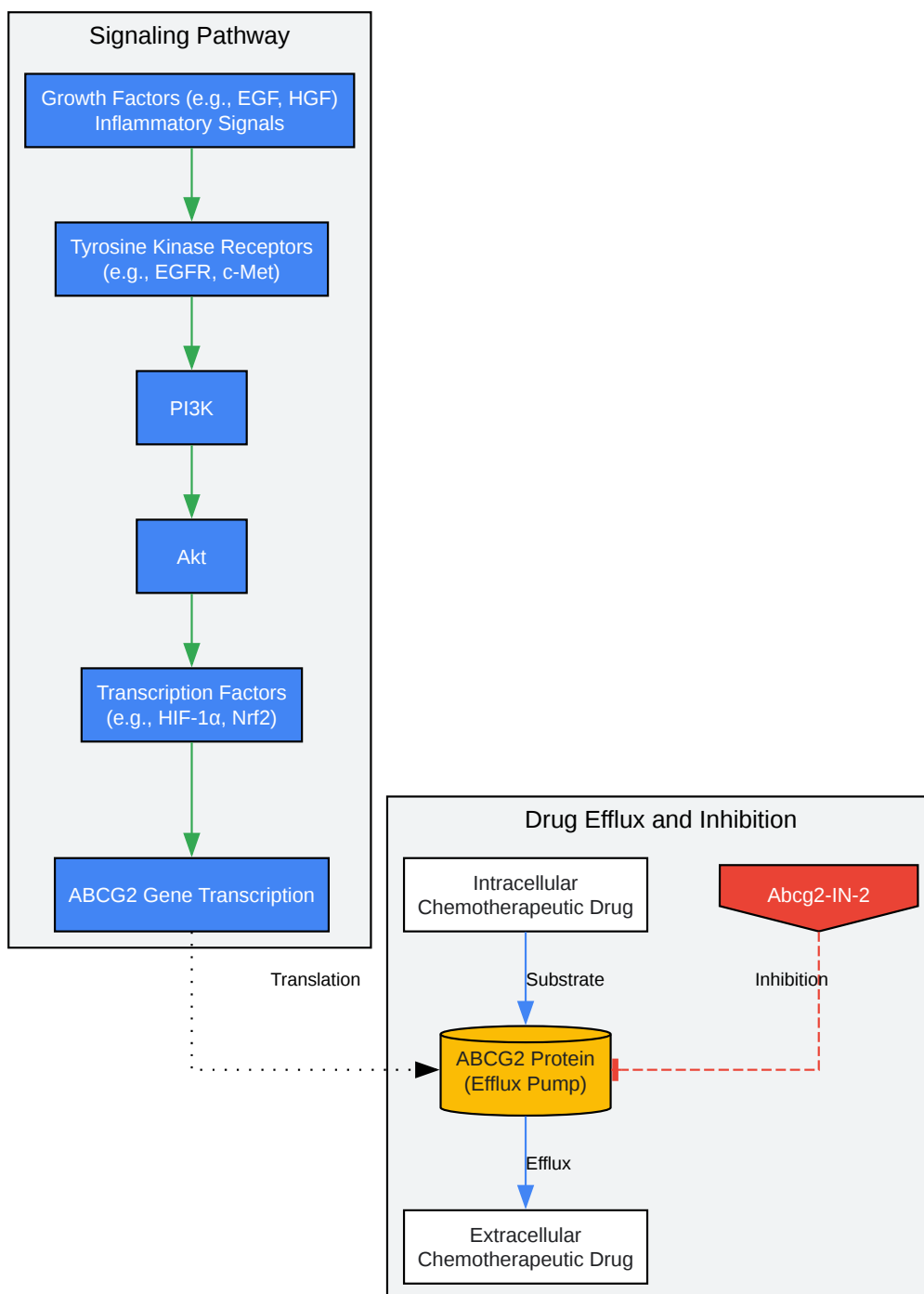
Simplified ABCG2 Regulation and Inhibition Workflow