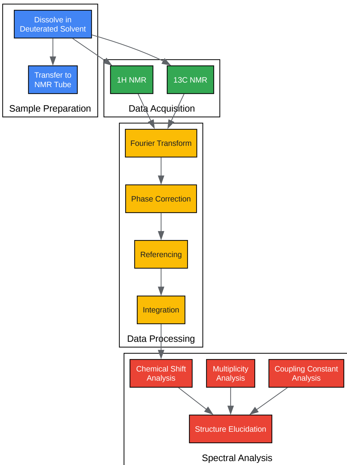
Figure 2: NMR Analysis Workflow

Click to download full resolution via product page