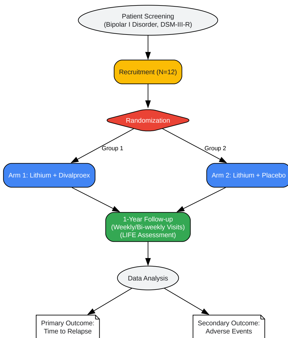
Workflow for a Randomized Controlled Trial.