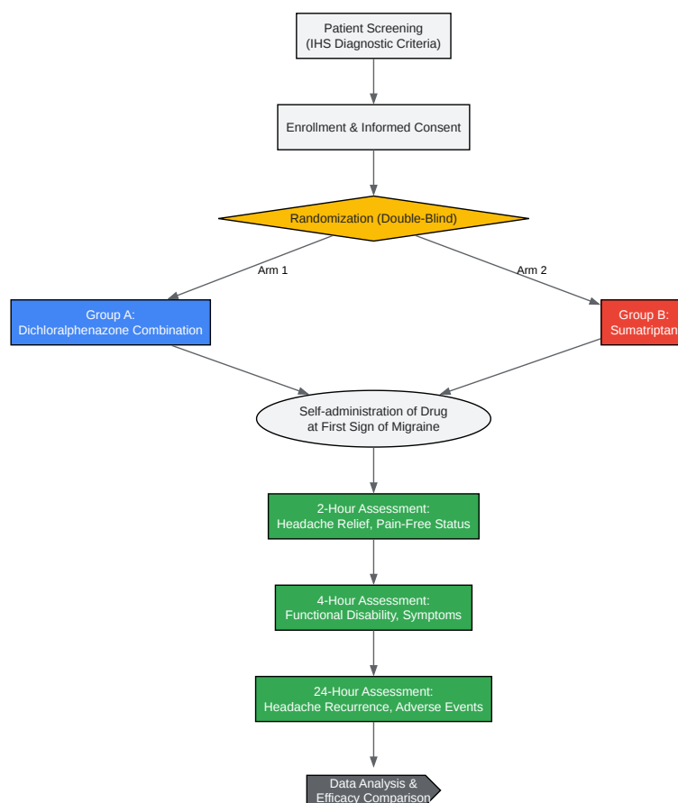
Generalized Workflow for an Acute Migraine Clinical Trial

Click to download full resolution via product page