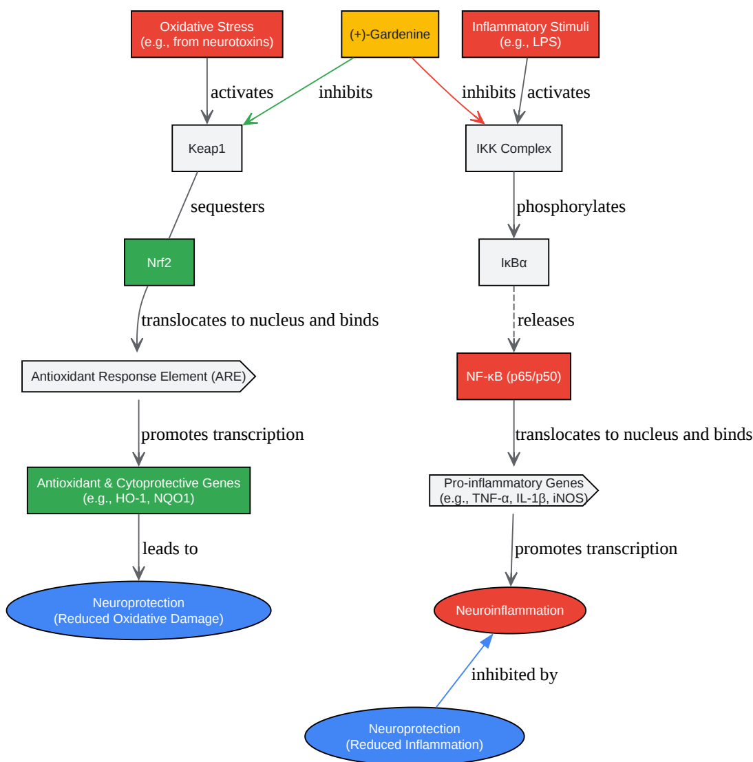
Figure 1: Proposed Neuroprotective Signaling Pathway of (+)-Gardenine

Click to download full resolution via product page