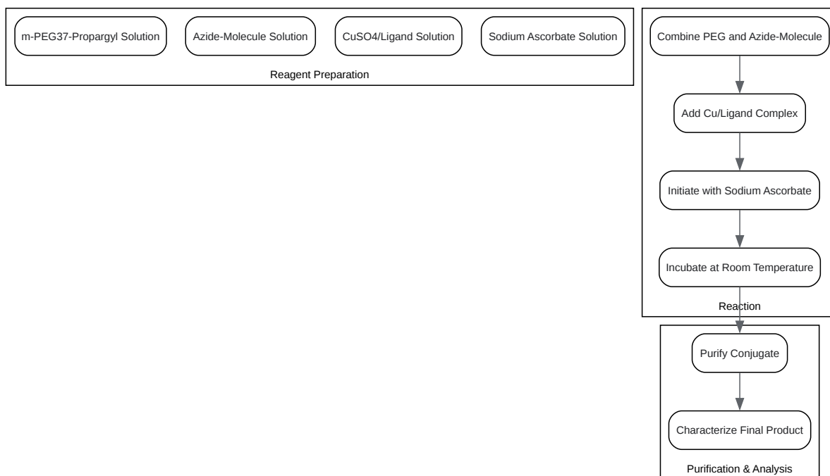
Figure 2: Experimental Workflow for CuAAC Conjugation

Click to download full resolution via product page