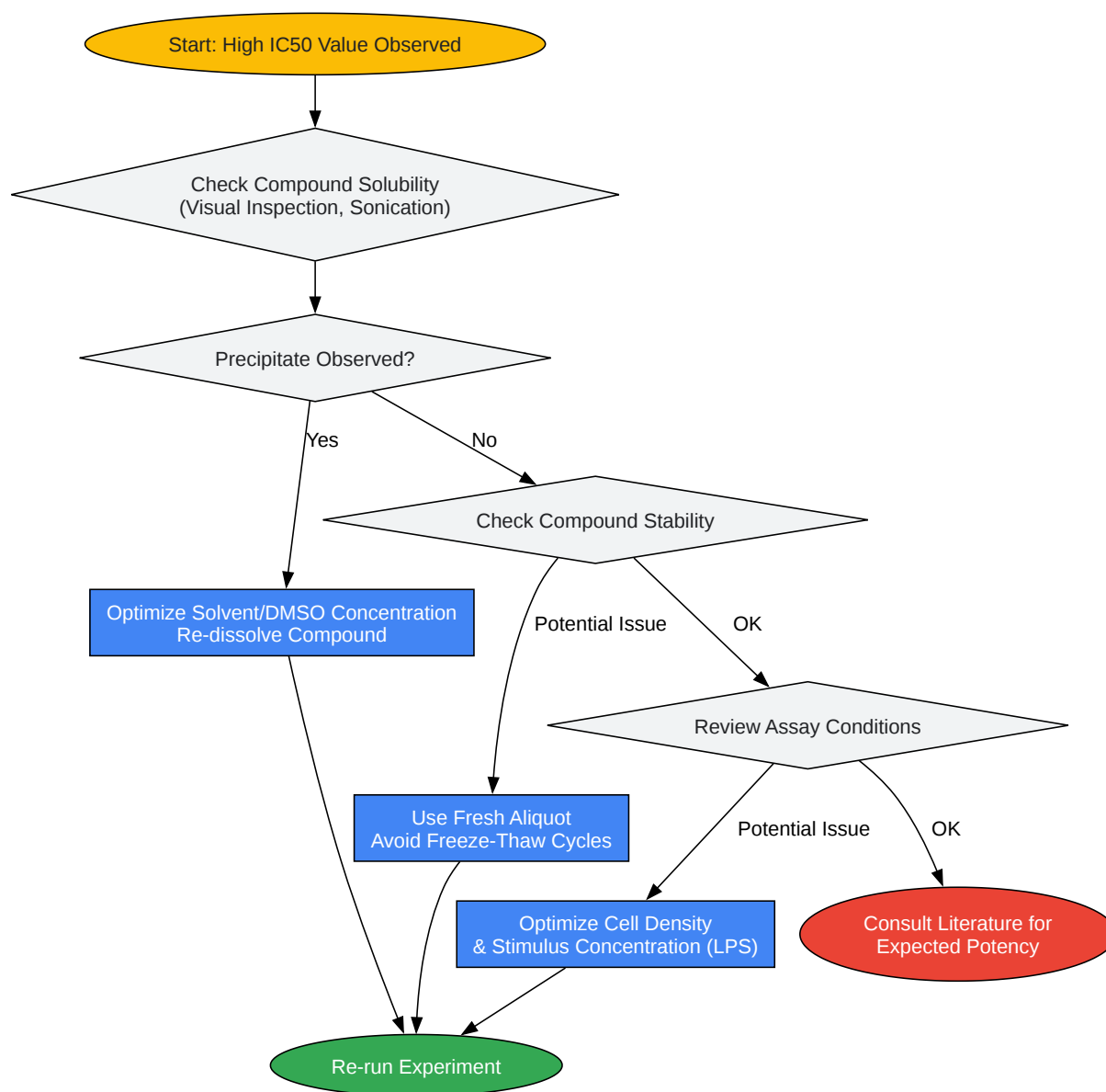
Diagram 3: Troubleshooting High IC 50 Value

Click to download full resolution via product page