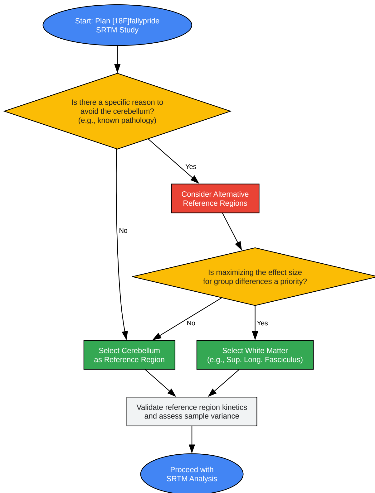
Caption: The Simplified Reference Tissue Model (SRTM) concept.

Click to download full resolution via product page