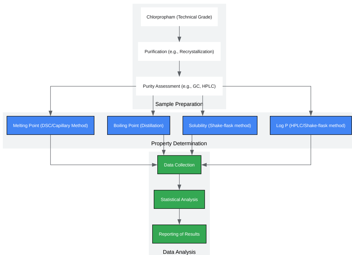
Figure 2: General Experimental Workflow for Physicochemical Characterization

Click to download full resolution via product page