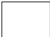
Figure 1: Chemical Structure of Uvaol.

Click to download full resolution via product page