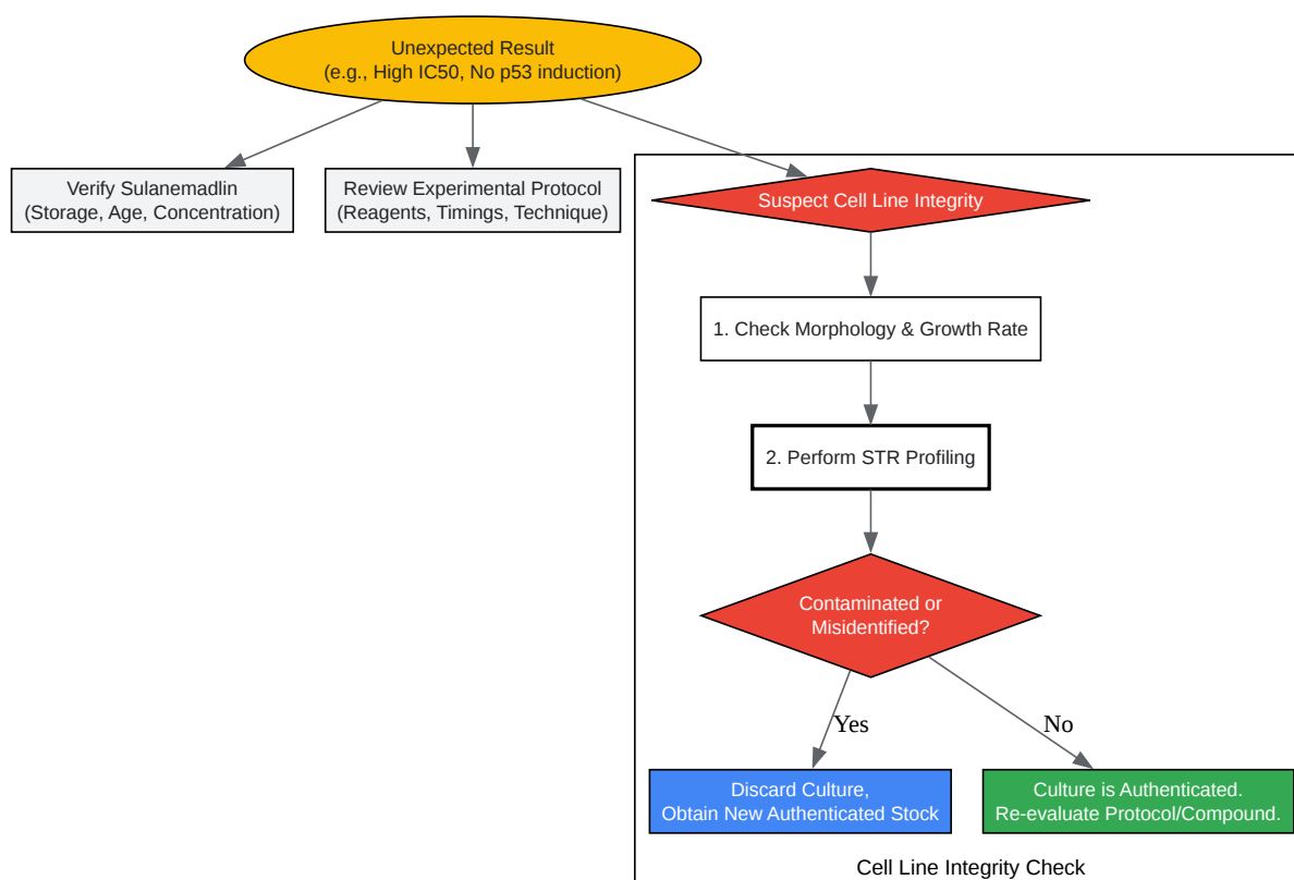
Figure 2: Troubleshooting Workflow