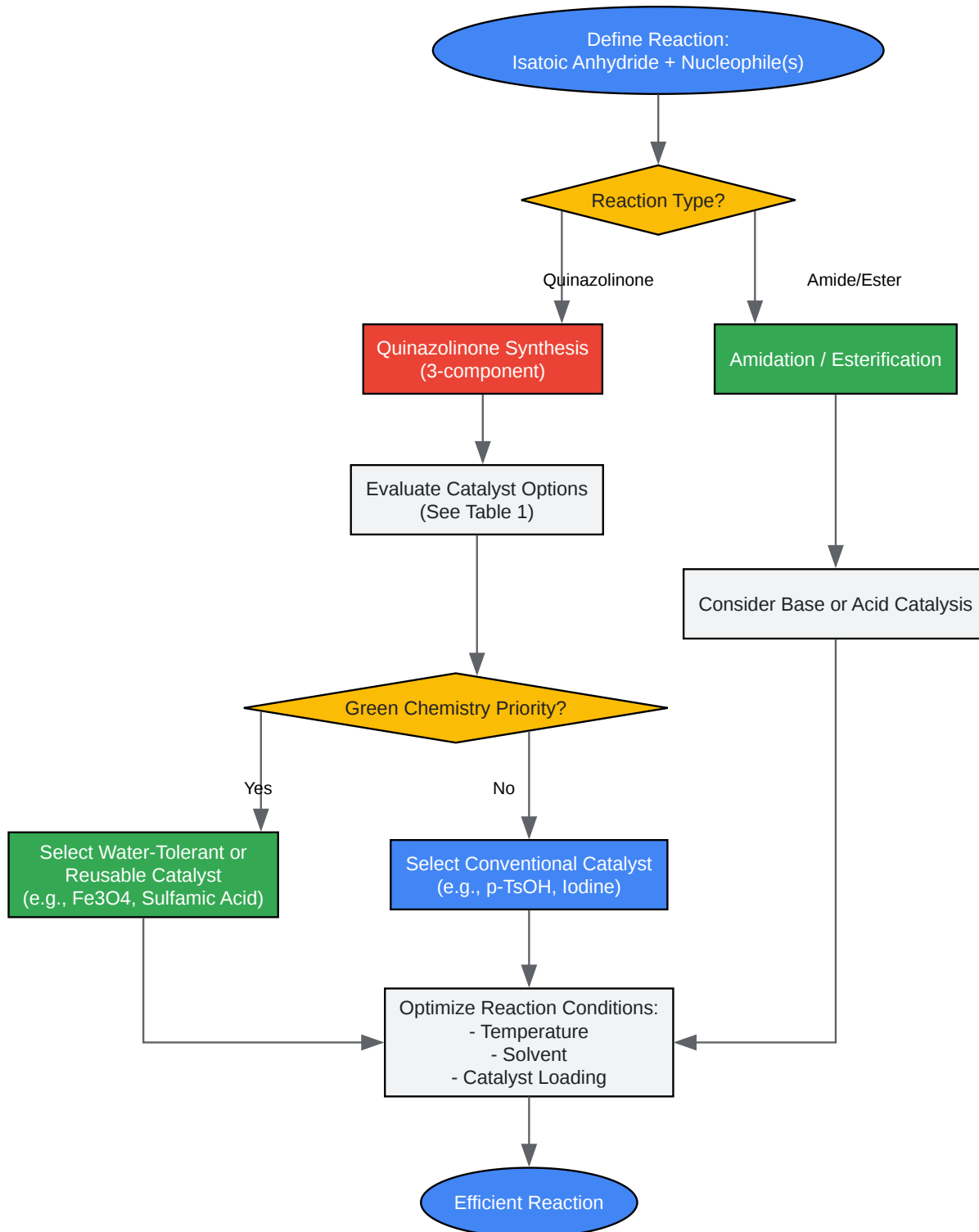
Catalyst Selection Workflow for Isatoic Anhydride Reactions

Click to download full resolution via product page