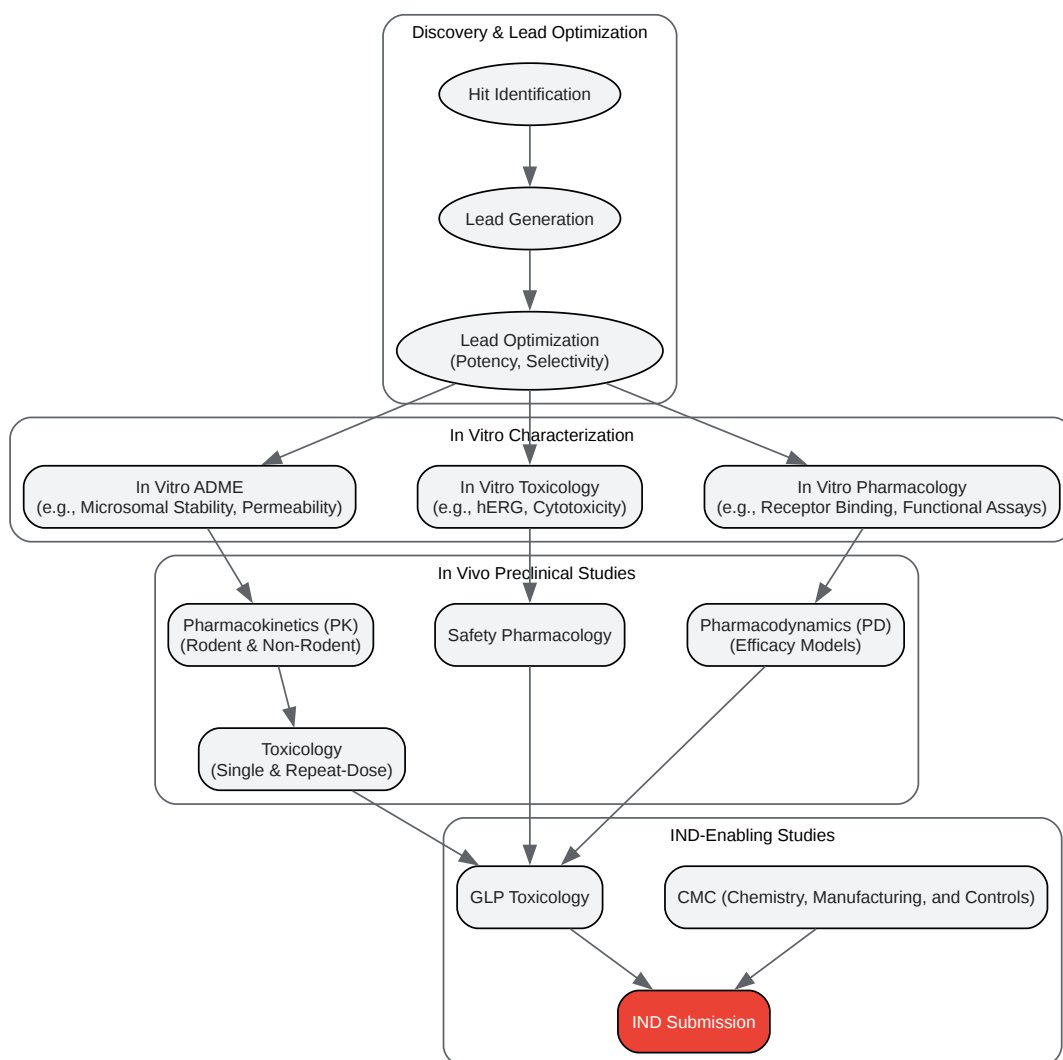
Figure 2. General Preclinical Development Workflow

Click to download full resolution via product page