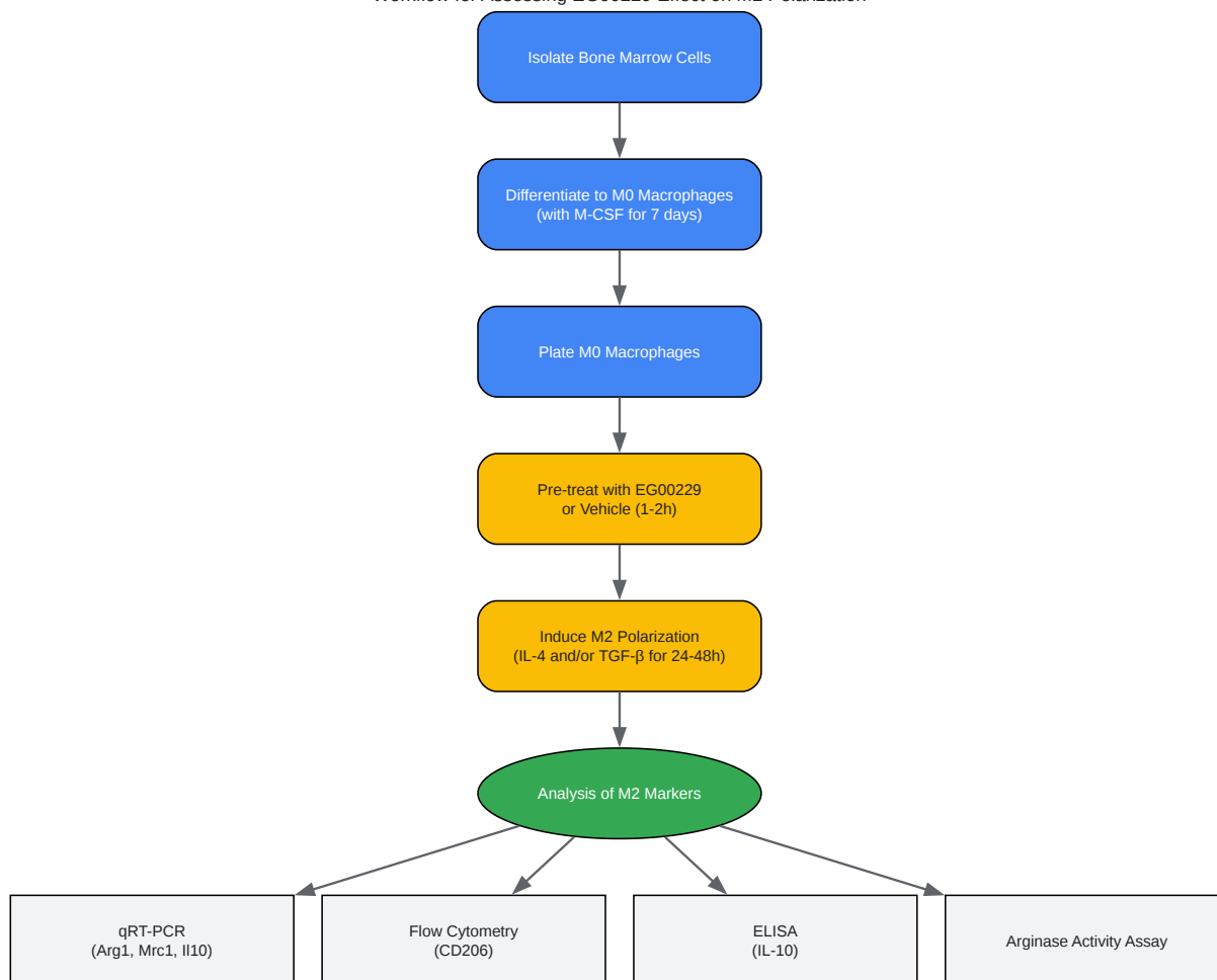
Workflow for Assessing EG00229 Effect on M2 Polarization

Click to download full resolution via product page