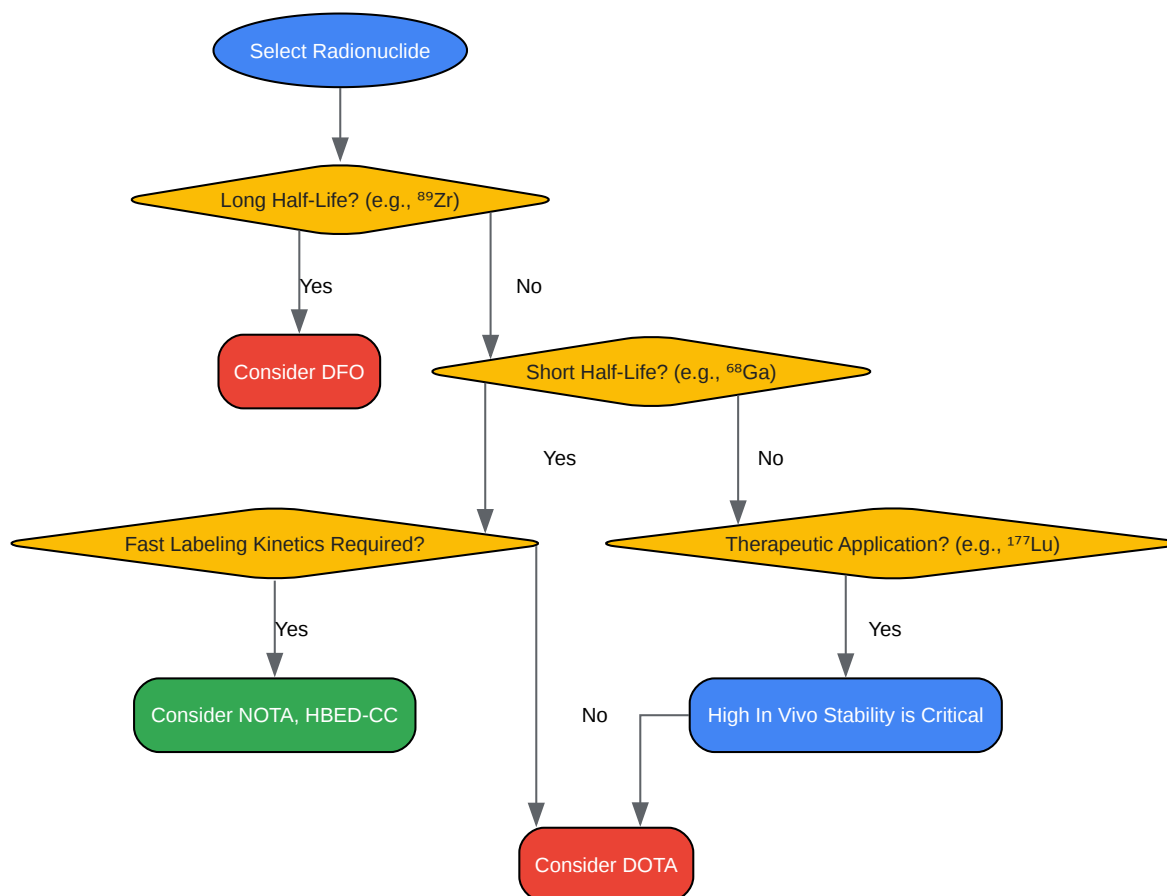
Caption: Components of a BFC-based Imaging Agent.

Click to download full resolution via product page