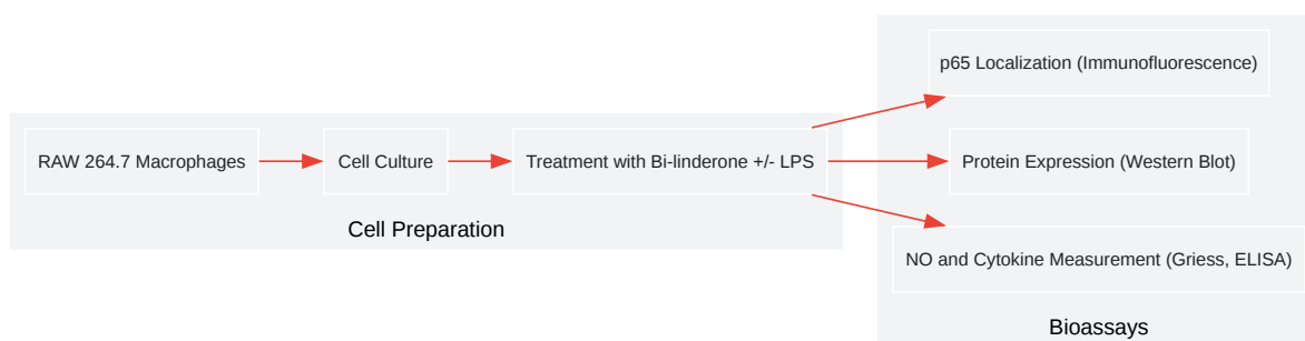
Figure 2: Workflow for assessing the in vitro anti-inflammatory activity of Bi-linderone.