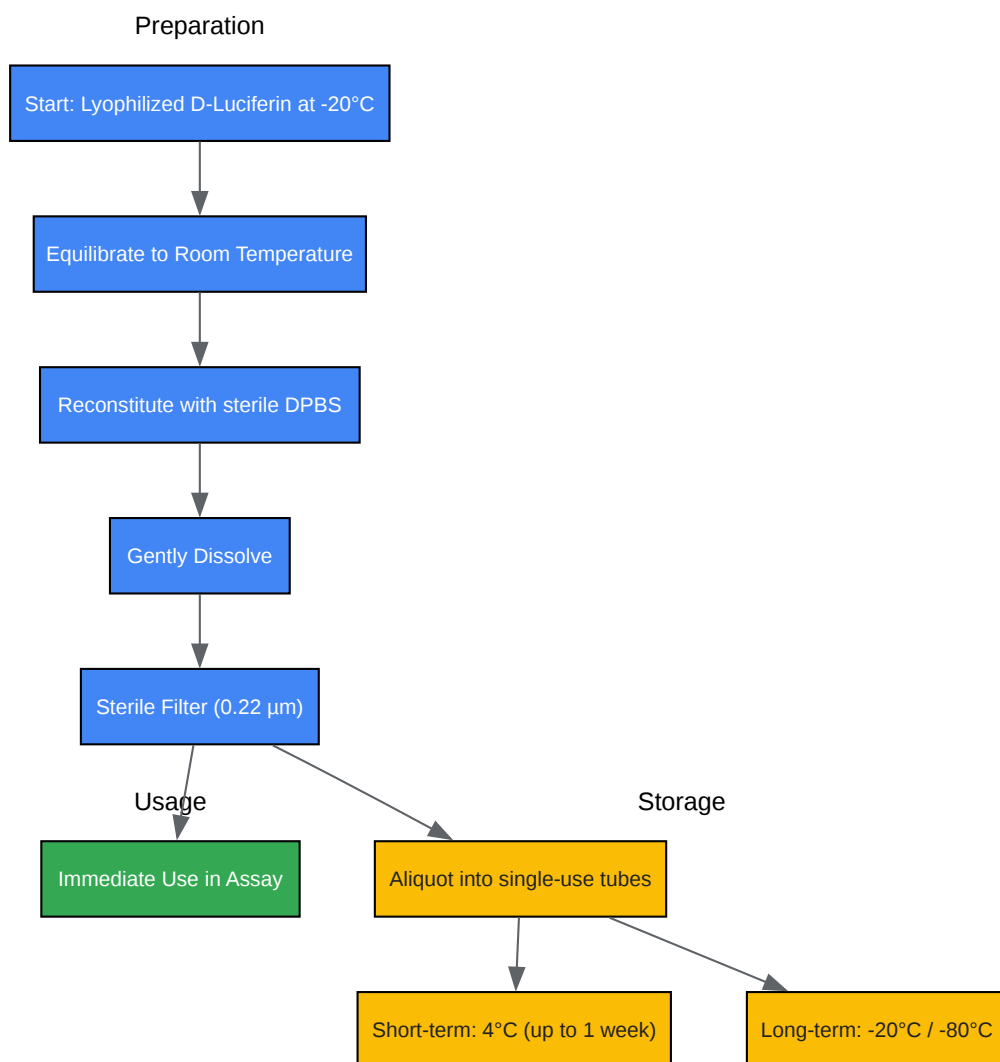
Figure 1. Workflow for Preparation and Storage of D-Luciferin Solution

Click to download full resolution via product page