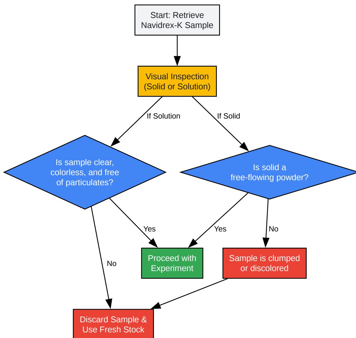
Fig 1. Troubleshooting Workflow for Stored Samples