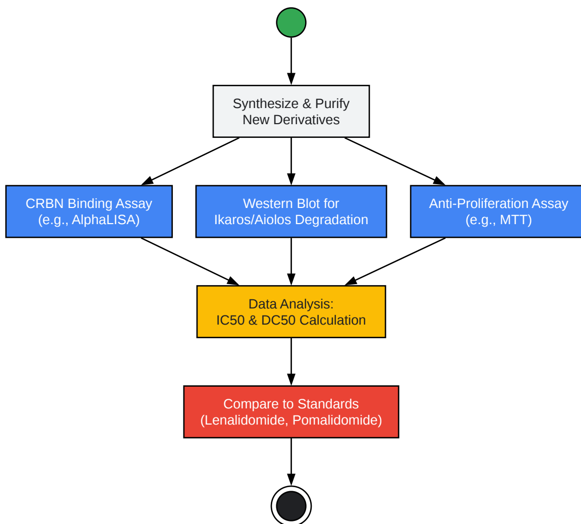
Caption: Mechanism of action for Lenalidomide derivatives.

Click to download full resolution via product page