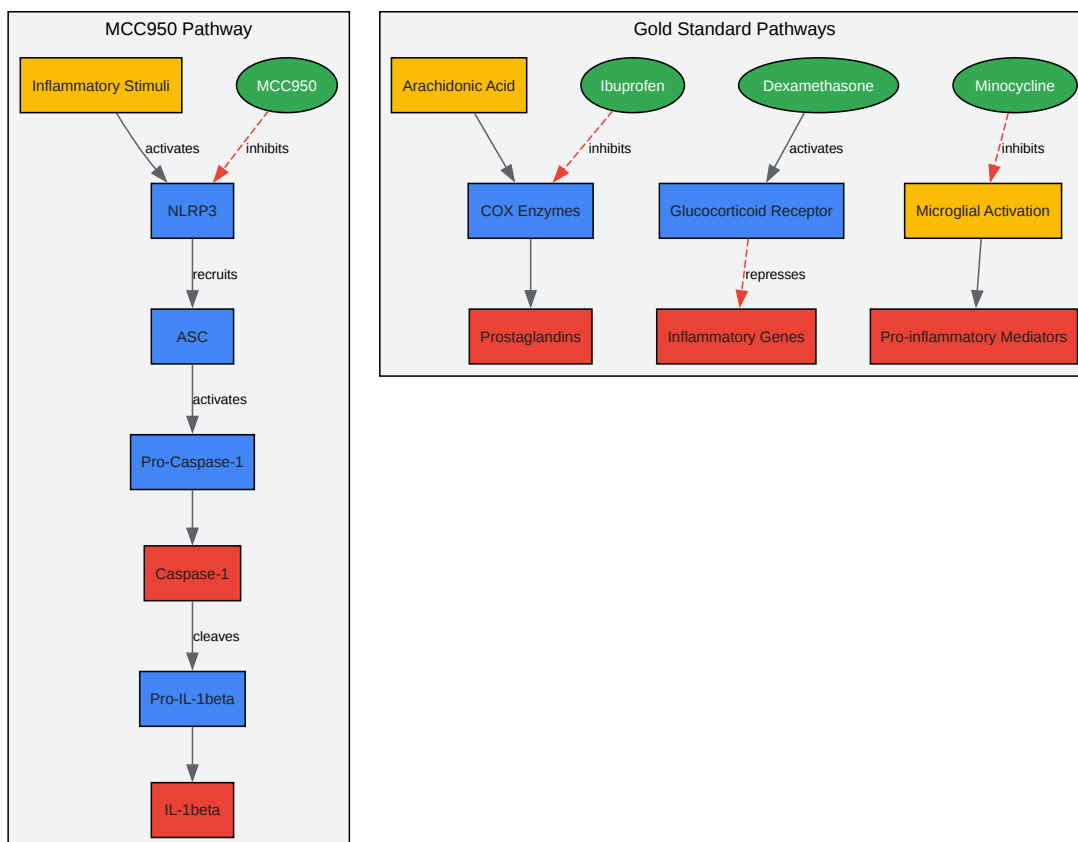
Comparative Signaling Pathways of Neuroinflammation Inhibitors

Click to download full resolution via product page