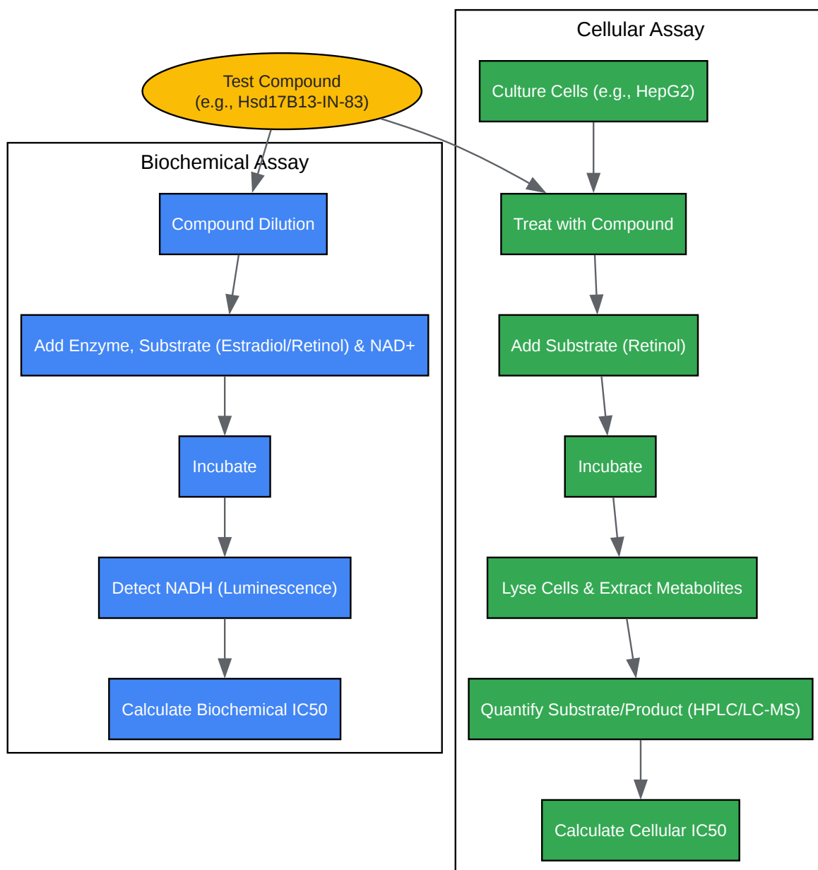
General Workflow for HSD17B13 Inhibitor Benchmarking

Click to download full resolution via product page