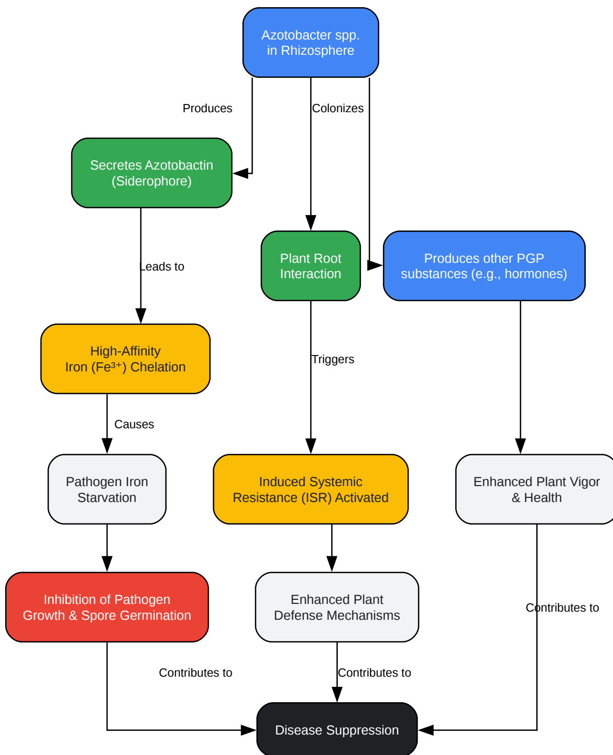
Figure 1: Biocontrol Mechanisms of Azotobactin

Click to download full resolution via product page